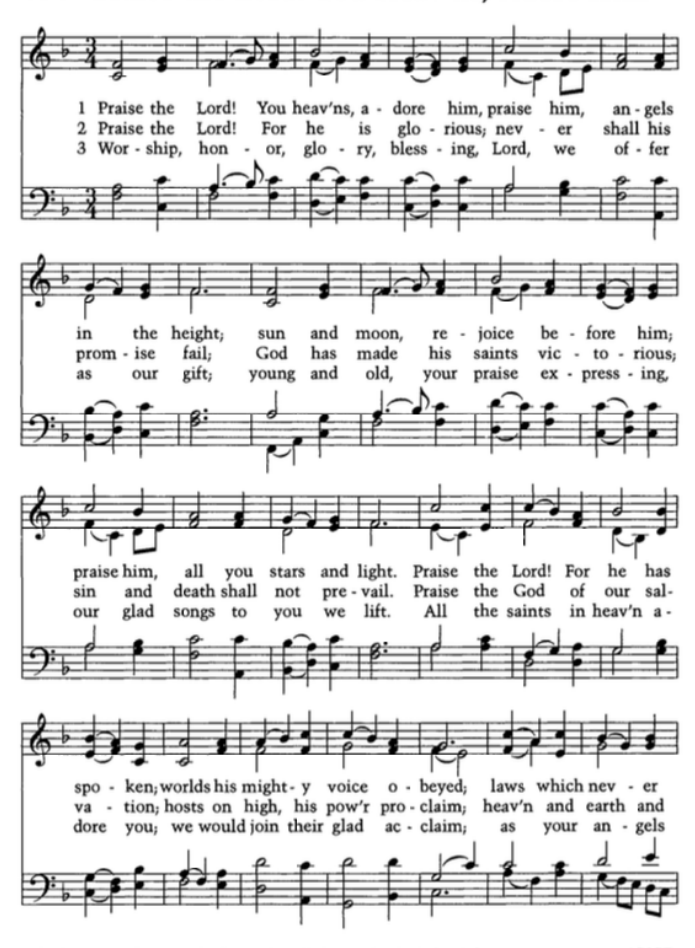
TEXT: St. 1, 2 "Foundling Hospital Collection" (c. 1796), alt. _{\rm I} st. 3 Edward Osler (1836), alt. TUNE: Rowland Hugh Prichard (1885)