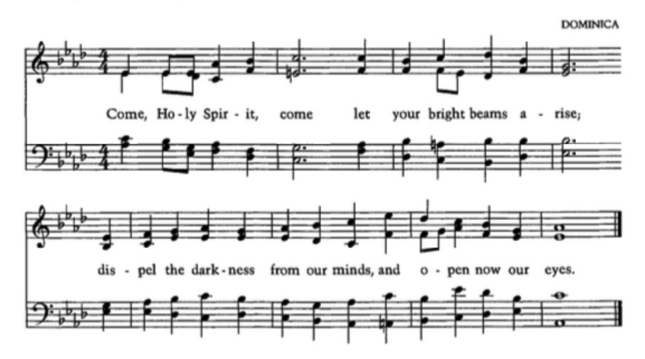
(Kneeling or sitting)

We praise you, together with the Father and the Son, now and forever.