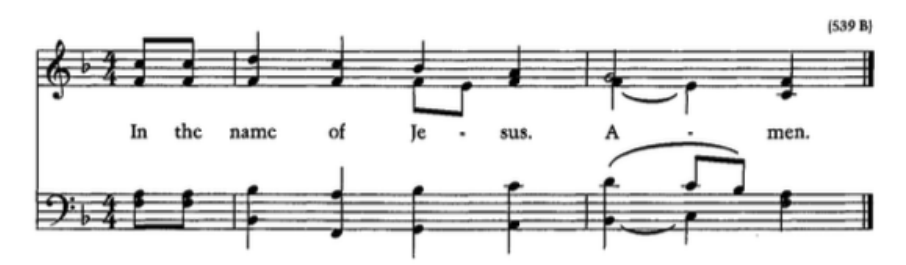
(If there are no Affirmations of Baptism through Confirmation, Reaffirmation of Faith, or Transfer of Membership, the following hymn is sung here.)